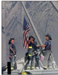
Raising the Flag at Ground Zero by Thomas E. Franklin © 2001 The Record.